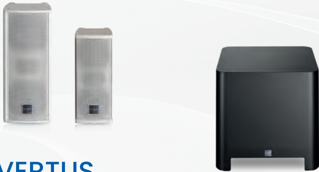
VERTUS COLUMN POINT SOURCE & SUBWOOFER