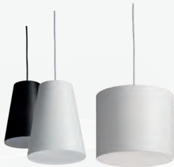
LIBRA PENDANT POINT SOURCE & SUBWOOFER