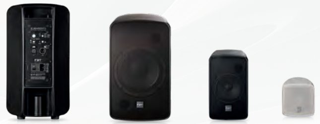
CANTO POINT SOURCE