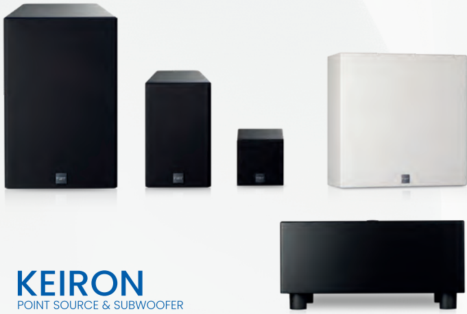
KEIRON POINT SOURCE & SUBWOOFER