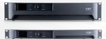
MIURA POWER AMPLIFIER