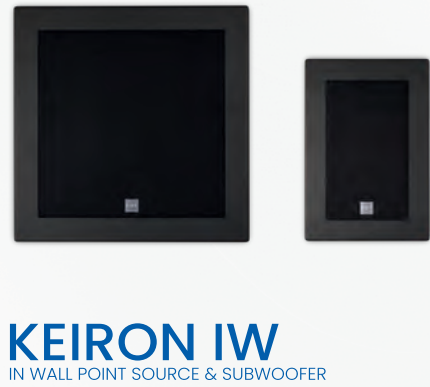
KEIRON IW IN WALL POINT SOURCE & SUBWOOFER