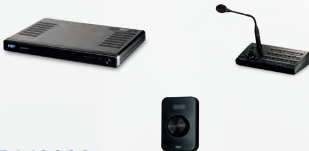
DM8208 DIGITAL MATRIX SYSTEM