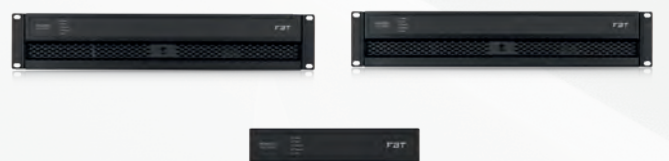
MDA SERIES DIGITAL AMPLIFIERS